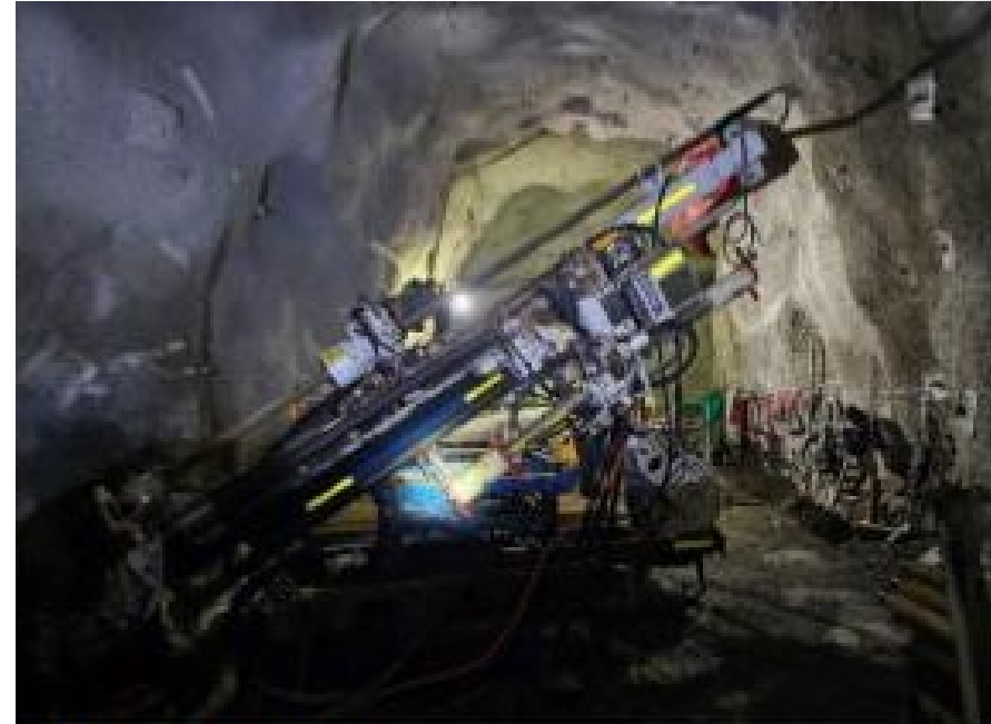
Underground exploration drilling commenced