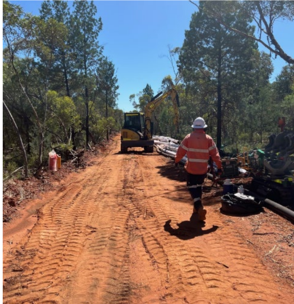
2 nd Federation- Hera Pipeline installation almost complete