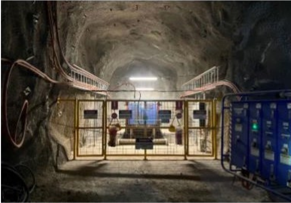
Underground electrical substation energised