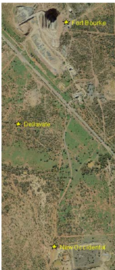
Figure 1: Location of Vibration Monitors on PGM’s Mining Leases.