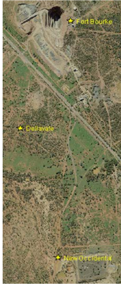
Figure 1: Location of Vibration Monitors on PGM's Mining Leases.