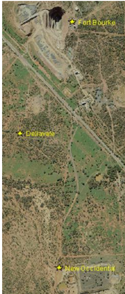
Figure 1: Location of Vibration Monitors on PGM's Mining Leases.