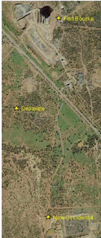
Figure 1: Location of Vibration Monitors on PGM's Mining Leases.