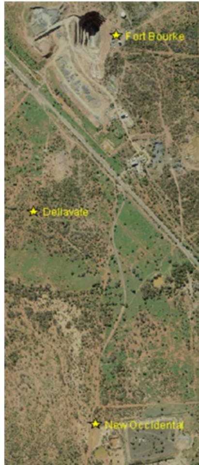
Figure 1: Location of Vibration Monitors on PGM's Mining Leases.