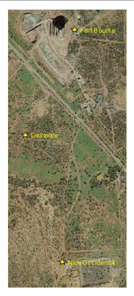
Figure 1: Location of Vibration Monitors on PGM's Mining Leases.