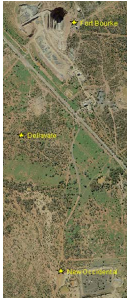
Figure 1: Location of Vibration Monitors on PGM's Mining Leases.