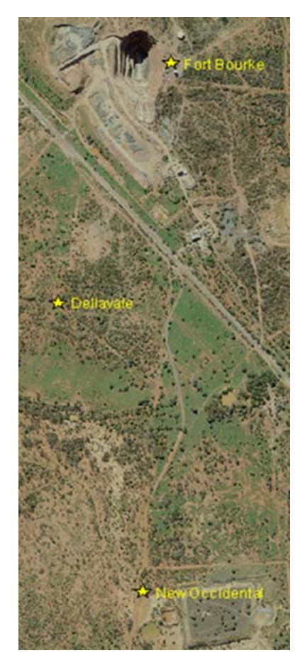
Figure 1: Location of Vibration Monitors on PGM's Mining Leases.