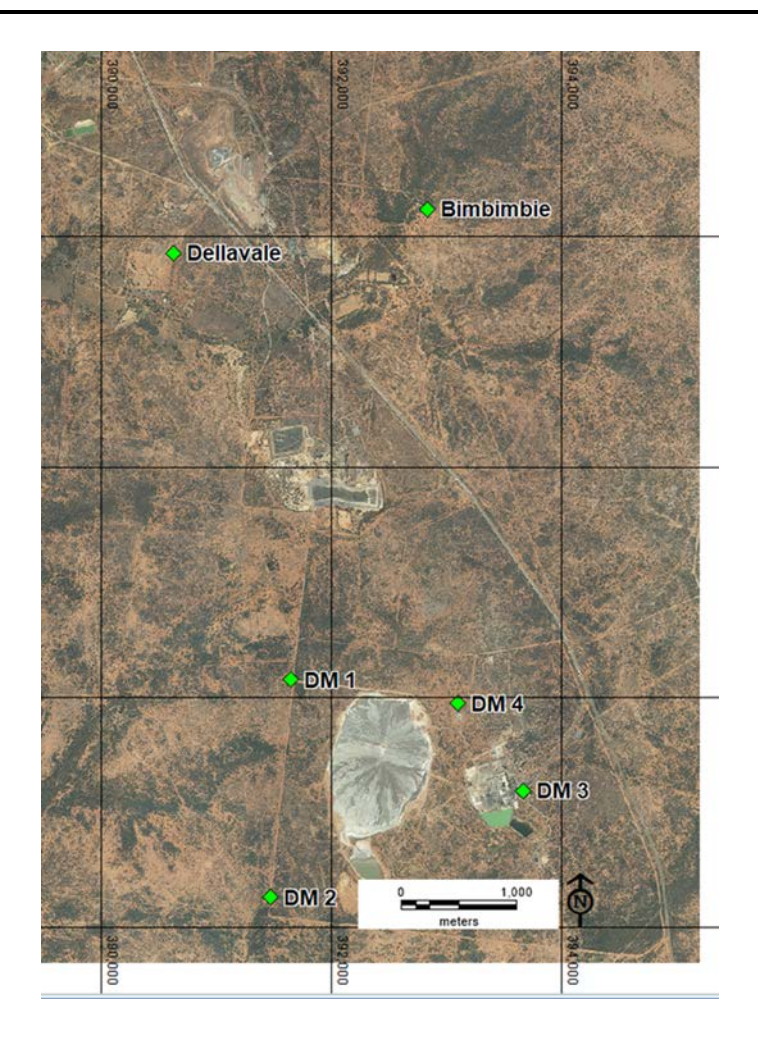
Figure 2: Location of dust gauges on PGM Mining Leases.