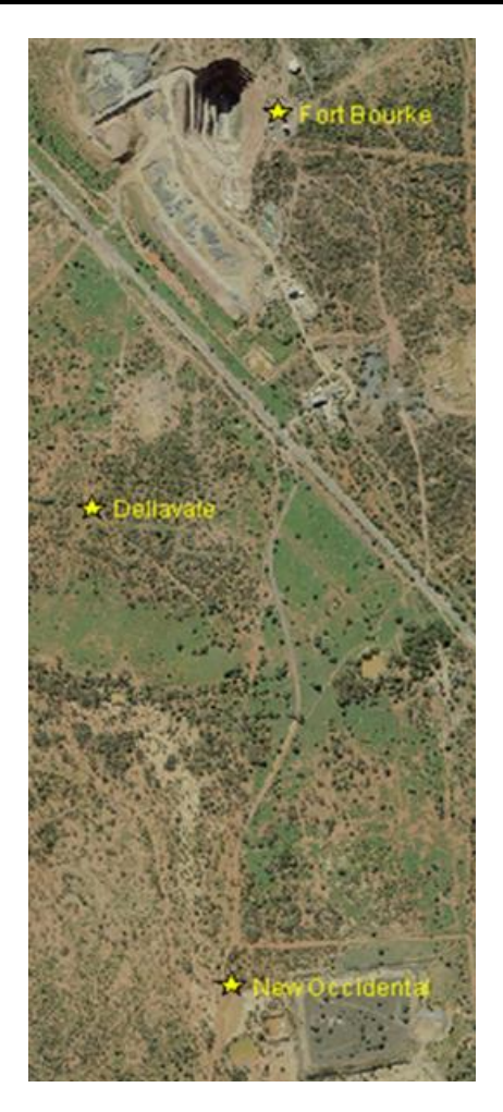
Figure 1: Location of Vibration Monitors on PGM's Mining Leases.