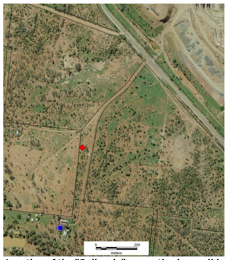
Figure 3: Location of the "Dellavale" properties house (blue circle) and noise monitoring location (red diamond).